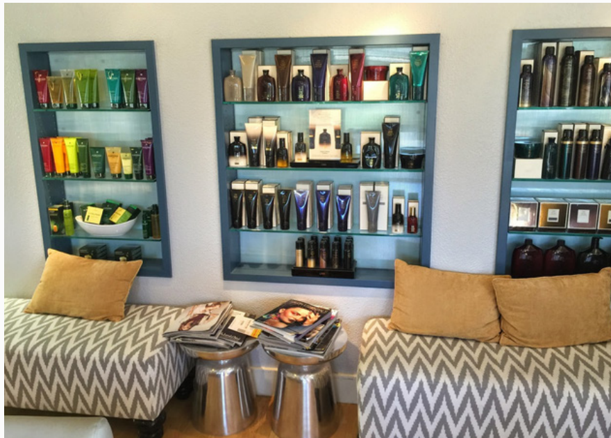
The very good hair products are all for sale here.